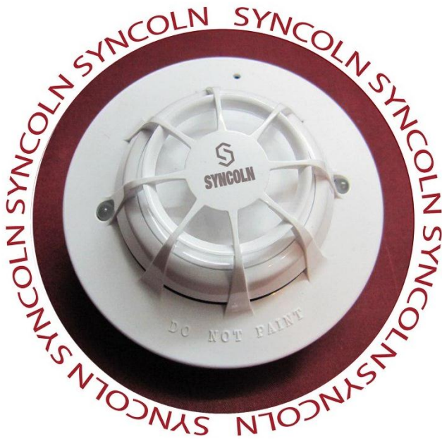
Part n. 5000-400

The Discovery Multisensor construction is similar to that of the optical detector but uses a different lid and optical mouldings to accommodate the thermistor (heat sensor). The sectional view (Fig2.) shows the arrangement of the optical chamber and the thermistor.